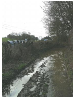
The lanes Paul Saunders